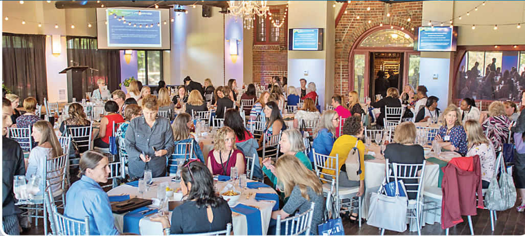
Women leaders in the Denver Metro enjoyed an afternoon of networking and learning at PMI Mile Hi's Women in PM Leadership Conference.