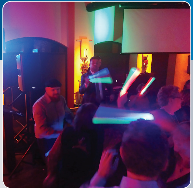
Dancing, dining and donating to charity were all part of PMI Mile Hi's 40th Anniversary Celebration, Denver, CO.

It was an elegant evening with gourmet dinner, dancing and a DJ, donation of toys for children, and a fundraising event for Food for Thought, a local charity providing meals for children, with more than $4,000 donated.