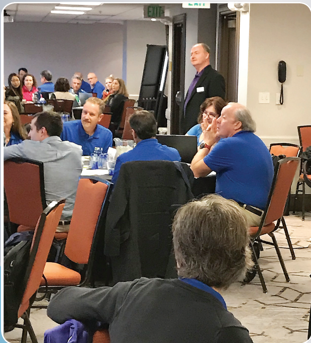
The Inaugural PM Day of Service at PMI Mile Hi was the Chapter's commemoration of International Project Management Day.