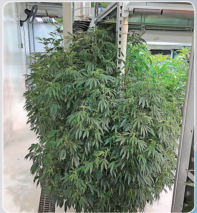
A tour of MEDPHARM, a medical marijuana dispensary, was a highlight of PMI Mile Hi's 4th Annual PM Week.