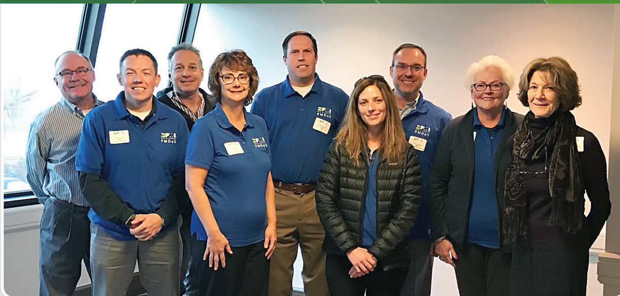
Bringing project managers & nonprofits together at our Inaugural PM Day of Service.