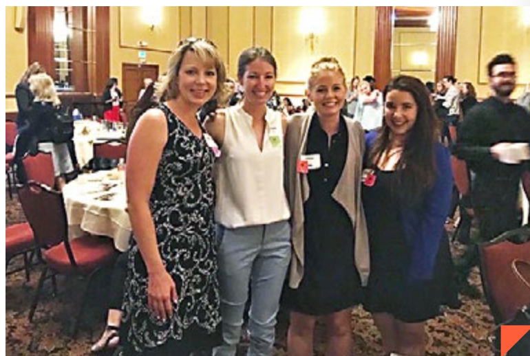
Networking at Women in PM Leadership Conference