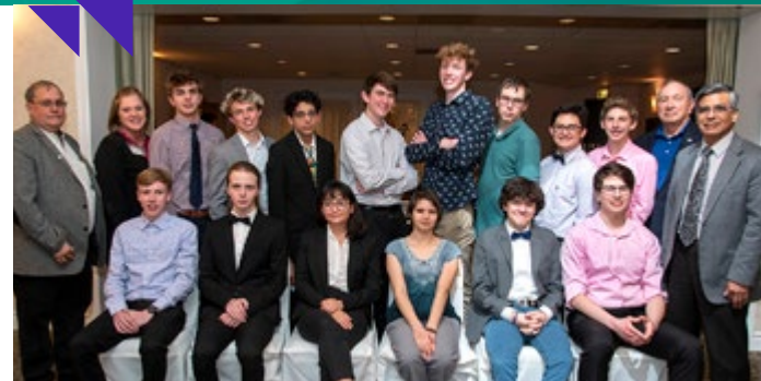
Winners of the Foundation's Projects of the Year Competition from Thomas Jefferson High School and the Cherry Creek Innovation Center