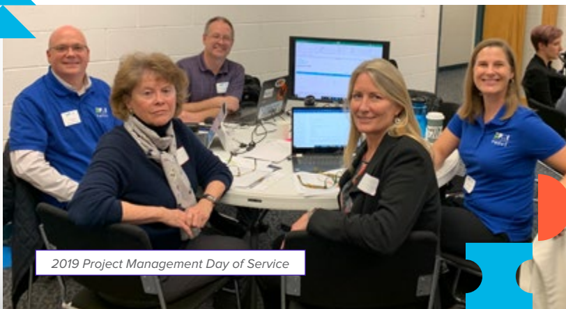
2019 Project Management Day of Service